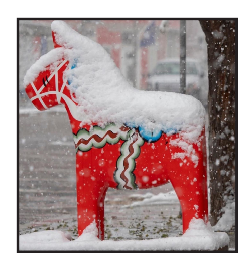
continued on pg. 6